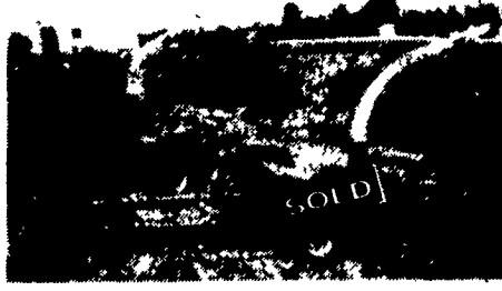
Gehl 860 Harv. tandem axle Elect. cont. $6,200