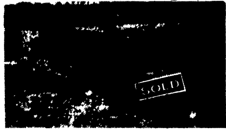
F.N.H. 790 Harv. electric cont. $5,400