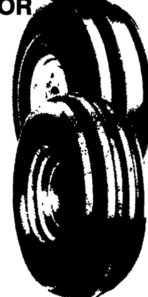
Champion Guide Grip™