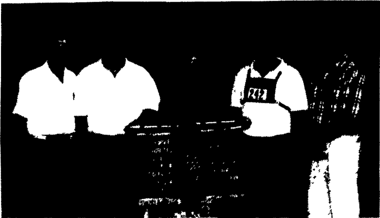
El-Dor Farms of Chambersburg was named the show's premier breeder and exhibitor for the third consecutive year.