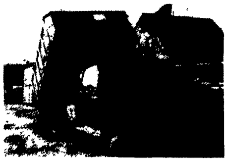
8'W Eby Aluminum Dump Bed, 9'L w/30' High-Removable Sides Office 610-347-0688