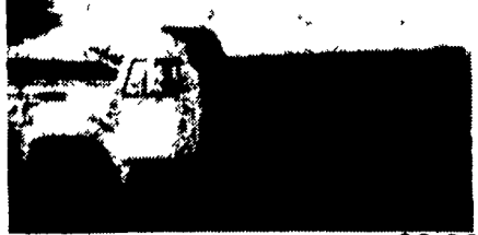
1983 IH S1900, SA, dump truck $9,000