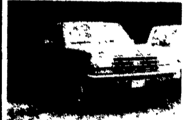
1989 FORD F250 4x4 351. Auto. AC $11,400