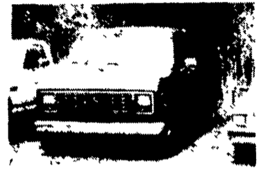
1989 FORD E150 CARGO VAN V8, Auto. $6,400