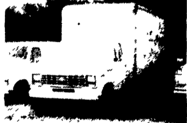
1988 FORD E-350 351 V-8, Auto, 14' Gruman Van Body $9,200