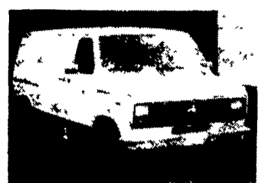
1990 FORD E150 CARGO VAN 6 Cyl., Auto. $8,900