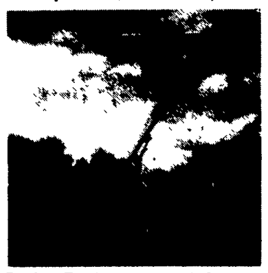
Bucket Trucks 28' to 65' Gas and Diesel. Call For Details.

DIGGER DERRICKS/AERIAL BUCKETS/UTILITY EQUIPMENT