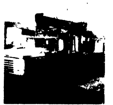
Need A Lift? We Have A Large Selection Of Boom Trucks Up To 14,000 lbs. Cap. Some With Post Diggers.