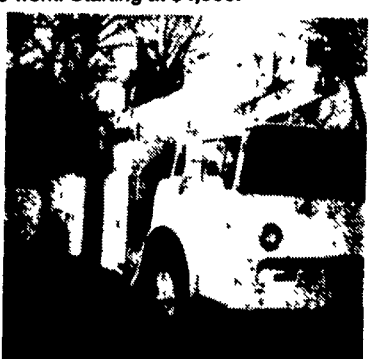
Pitman Boom with jib 15,000 pounds cap - 4 outriggers. Sale Price $8,250.00 Won't Last Call Now!!

This is one of six units we have all ready to work. Starting at $4,500.