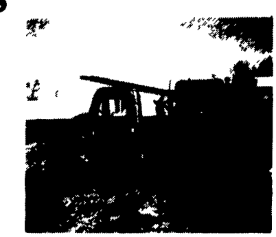
is Ready To Work, Sale Price $6,500