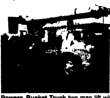
jib working ready.