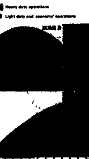
MF 6150 - MF 6120 TRACTORS