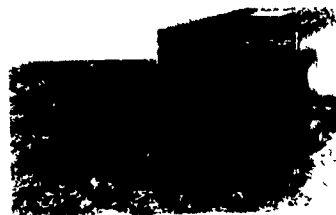
6000 Land Finishers