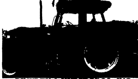
BINKLEY & HURST BROS., INC. (717) 626-4705

133 Rothville Station Road P.O. Box 0395, Litz, PA 17543-0395 1-800-487-2978 Located 1/2 Mile North of Rothville Fax 717-626-0996