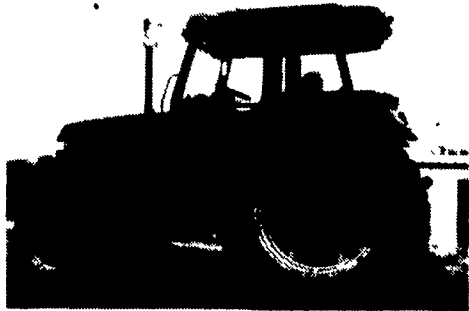
Case IH Maxxum 5220 Cab & Air and P. Shift Low Hrs., 80 HP Case IH Maxxum 5230 Cab & Air and P. Shift, 90 HP, Low Hrs. Come and Make Your Deal Today