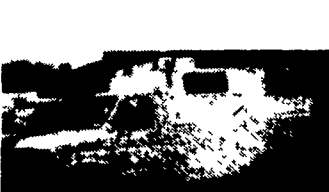
82-86 Ford GMC, Enc 9' Util, Gas, Auto, PS, PB, Generators/Air Compressors, Maintained by Major Utility Co., Ready To Work

TWO ACRES OF ALL TYPES USED TRUCKS. "IF WE DON'T HAVE IT, WE'LL GET IT"