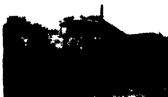
1979 DM MACK w/50,000 lb. Tri-Pak Roll-Off, 50,000 lb. Mack Rears, Inside/Outside Controls