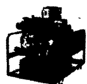
Diesel Powered Hot Water