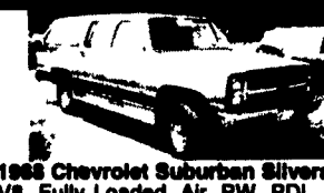
1988 Chevrolet Suburban Silverado, V8, Fully Loaded, Air, PW, PDL, Tilt, Cruise, AM/FM, 3rd Seat, Custom Red & Silver Paint w/Grey Cloth, Priced To Sell At Only $10,995