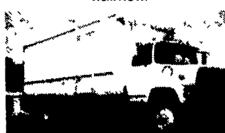
1988 Ford LN8000, 24' Box w/Side Door & 2,500 lb. Lift Gate, 7.6 Ford Turbo Del, 210 HP, 5+2 Sp. Trans., 33,000 GVW, Full Air Brakes, Air Dryer, Stereo, Tape, CB and Much More, 83,000 Miles, 1 Owner, Very, Very Well Maintained