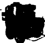
Hot Water Self Contained Units Mobile Washer Delight