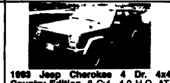
1993 Jeep Cherokee 4 Dr. 4x4 Country Edition, 6 Cyl., 4.0 H.O. AT, AC, PW, PDL, Tilt, Cruise, Aqua Blue & Gold w/Tan Cloth & Matching Alloy Whis., Only 29,000 Mi. $17,995