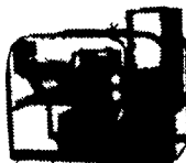
Gas Powered Hot Water