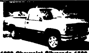
1988 Chevrolet Silverado 1500 4x4, V8, 4 Spd., Air, AM/FM, Tilt, Brown & Tan w/Tan Cloth, Alloy Whis. & Very Clean w/Only 60,000 Mi. $9,995