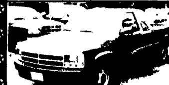
1995 Dodge Dakota Club Cab 4x2, 5 Spd., AC, AM/FM, Red.