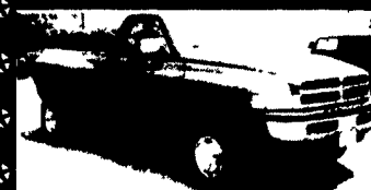
1985 Dodge 3500 4x4 SLT, Cummins Turbo Diesel, Fully Loaded, Red & Black w/Grey Cloth, 2 To Choose.