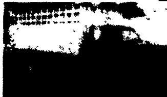
1977 GMC 6000, Grain/Cattle 24000 GVW, Alum. Body, 366 CID Gas 5/2 PTO, Alum. Belly Box, AM/FM

Just Off I-78, Between Allentown & Quakertown Financing Pre-Approved