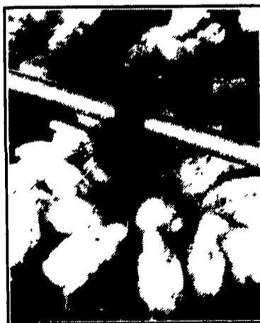
BIG DUTCHMAN BROILER SYSTEMS

It's interesting that some Poultry Producers who would never buy the cheapest tractor in the lot will buy the cheapest equipment for their birds. If you want equipment that lasts, that costs little to maintain but delivers a lot in every workday, you want what Producers all across the country have already discovered: Big Dutchman, the "Mark of Excellence" and Hershey Equipment, Co. "A Step Ahead". You can always find cheaper equipment. But these days, who can afford it?