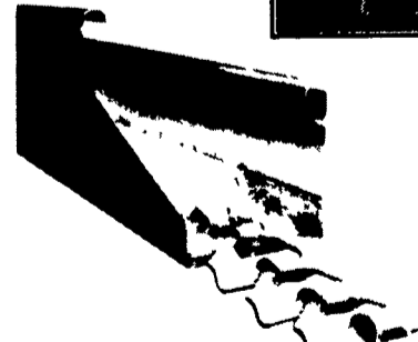
BIG DUTCHMAN FLAT CHAIN FEEDING SYSTEMS

It's interesting that some Poultry Producers who would never buy the cheapest tractor in the lot will buy the cheapest equipment for their birds. If you want equipment that lasts, that costs little to maintain but delivers a lot in every workday, you want what Producers all across the country have already discovered: Big Dutchman, the "Mark of Excellence" and Hershey Equipment, Co. "A Step Ahead". You can always find cheaper equipment. But these days, who can afford it?