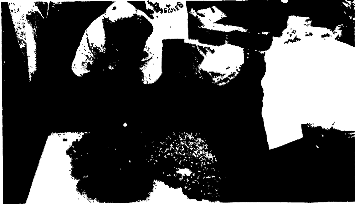
Berks 4-H Swine Club leaders ready the patties at the Kutztown Fair.