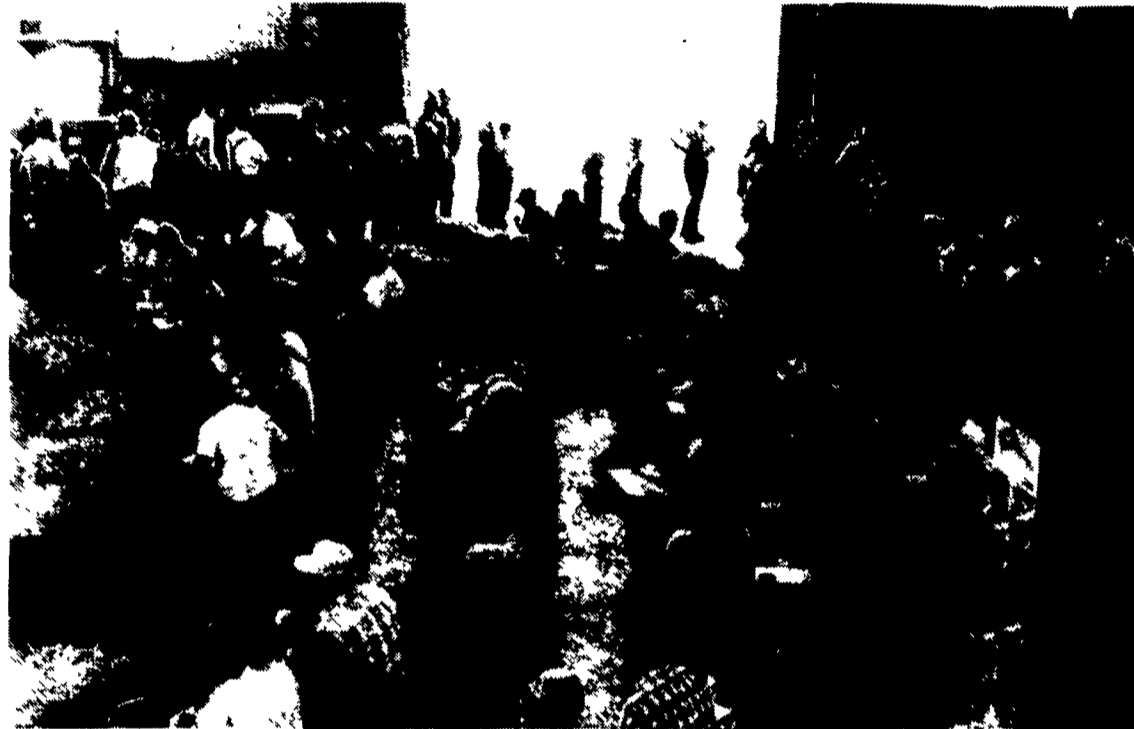
Visitors to a special tillage day event at Binkley & Hurst Bros. enjoy lunch and a chance to discuss their tillage and equipment needs.