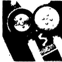
The cutting discs are pre-tensioned to work with optimal pressure. They're self sharpening and maintenance free.

When you use the CLAAS Autopilot in corn, the sensors follow the rows closely above the ground, and the JAGUAR steers dependably along the line. When reversing, the sensors swing forward and then reset automatically. The CLAAS Autopilot is invaluable in weed infested, hanging or laid crops, at night or in misty conditions.