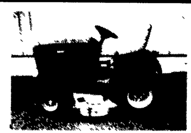
John Deere 3 Cyl Water Cool 322 50" Low Hr Gd $4.200°°