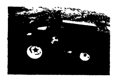
Ingersoll 222 Hydro 12HP 38" Cut Good Cond *1,295 ∞