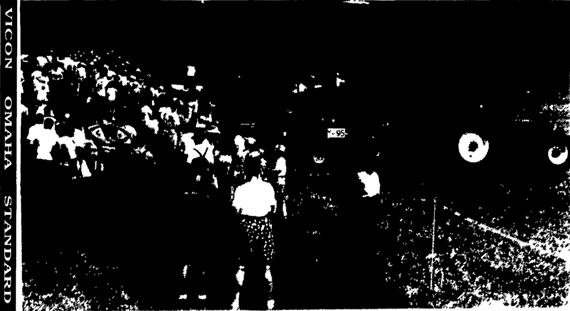
One of the major attractions on the program of Ag Progress Days is field demonstrations with various brands of equipment. Here the crowd gathers for the tillage