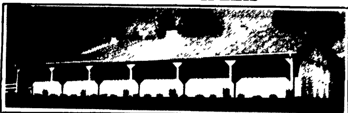
HORSE STALL BARN