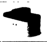
Model CT 2