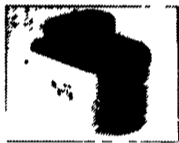
Model CT 1