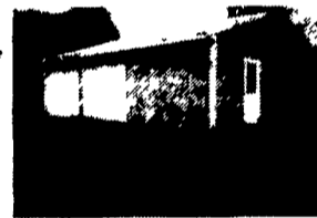
* Residential Garages