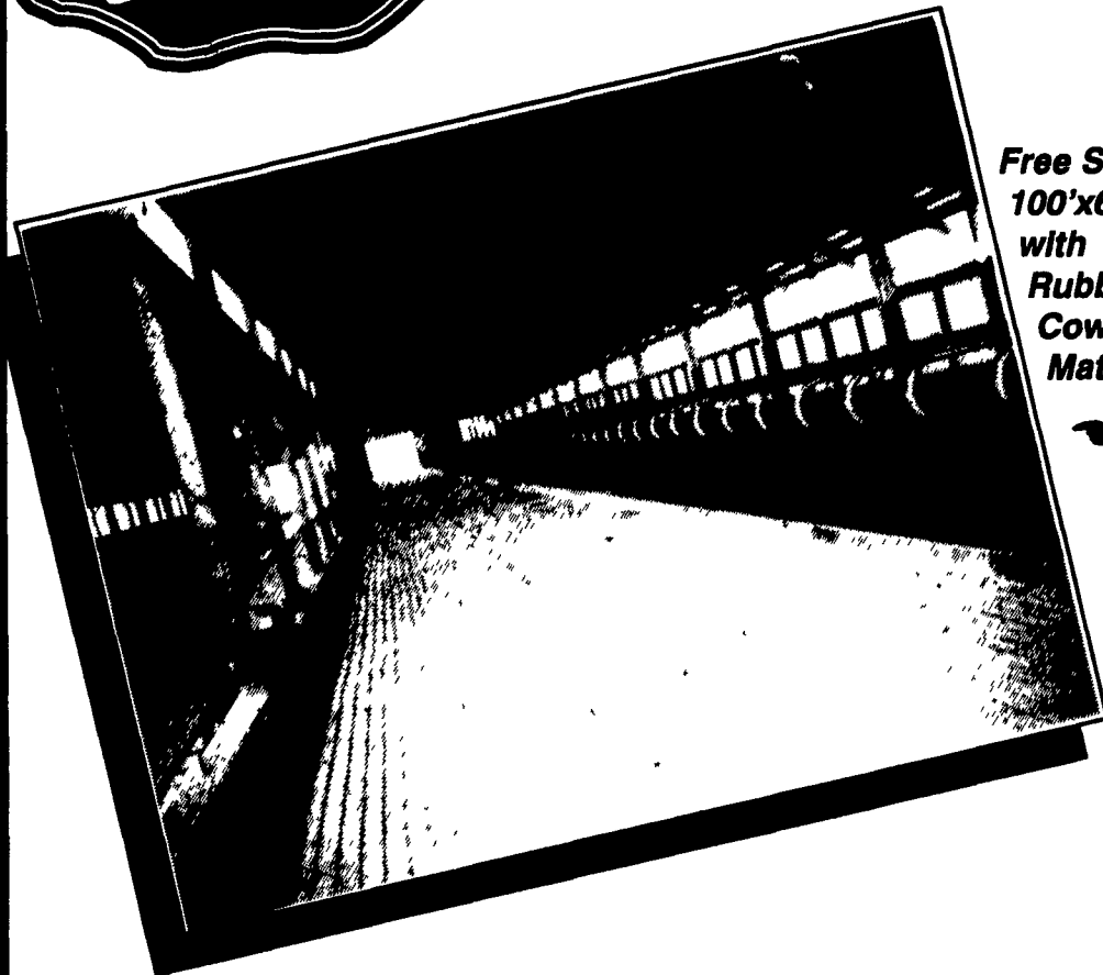
Free Stall Barn 100'x696'x12' with Rubber Cow Mattresses.