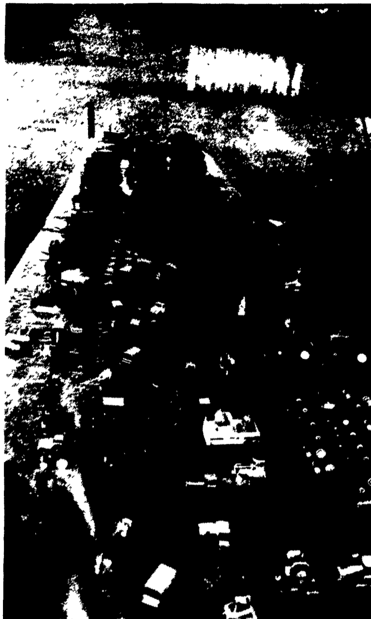
The toy farm equipment display brought out the kid in everybody who walked by.