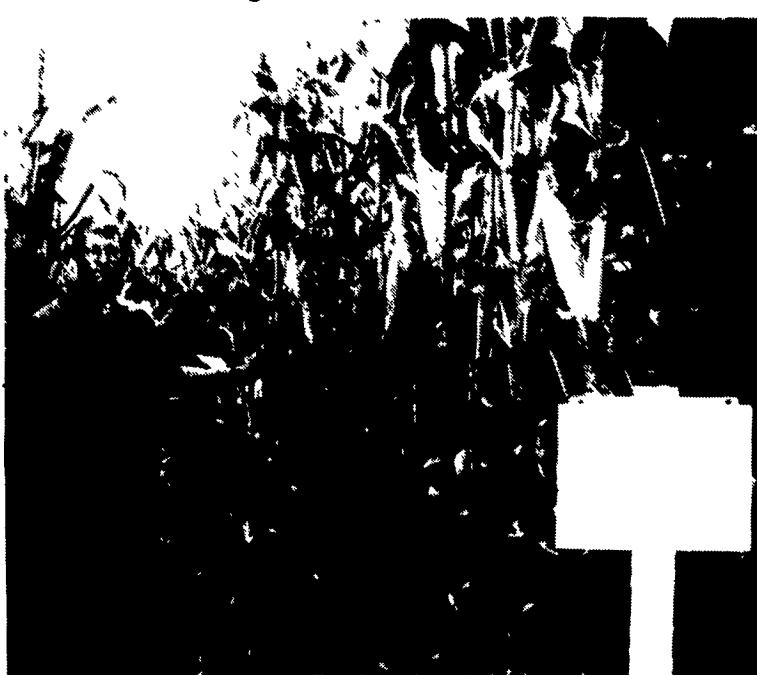
According to Mark Chegwidden, Agway intern, at the wider rows, stalk and cob sizes increase. At the narrower rows, while the cob and stalk sizes decrease, there are more plants per space which may result in greater yield.