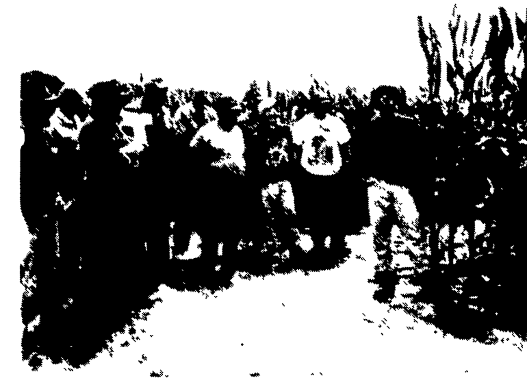
Research provided by Dean Kohler, Intern at Reading Bone Agway, examined how shorter planting depths affected corn height.

said a difference of a 1/2 inch can be can affect emergence and standability if planters stray too far from the 11/2-inch depth required, according to field trials at the (Turn to Page A45)