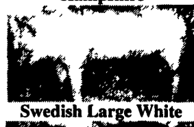
Swedish Large White