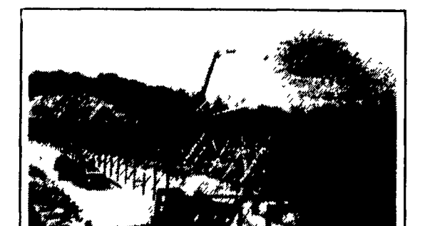
Trusses for Chicken House