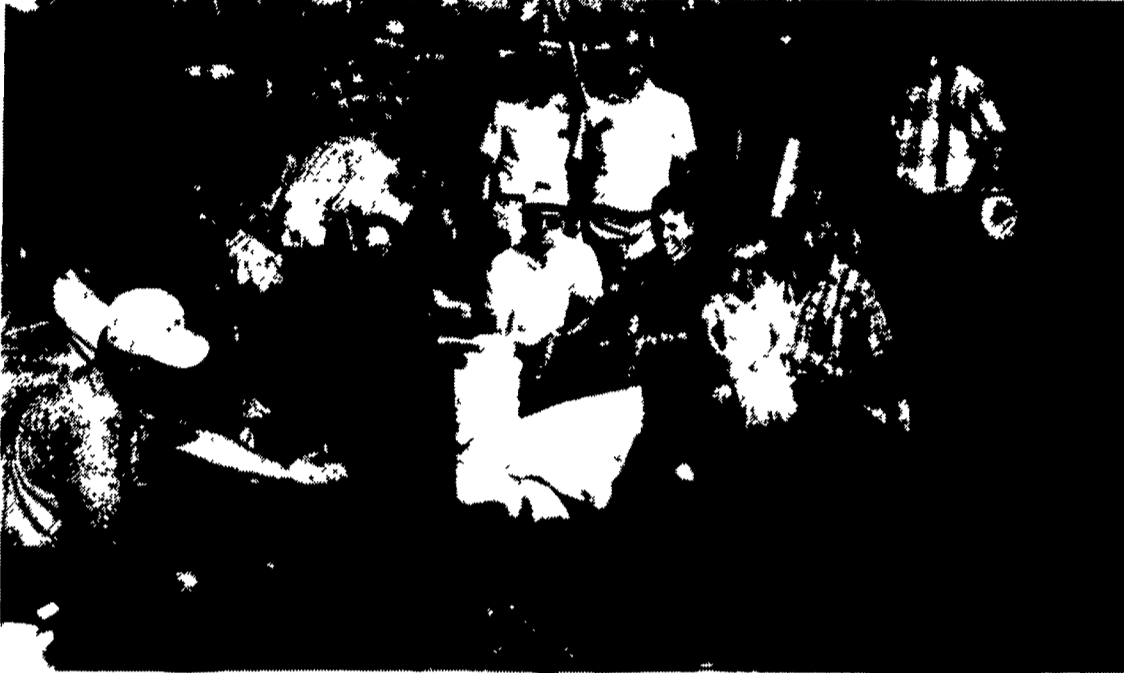
Dedication ceremonies for the new museum were Monday evening. As part of the day's dedication activities, museum committee members and friends turned the crank of an old one-hole corn sheller at the fairgrounds.

Eventually, Luckenbill said the plans are to feature tillage, planting, and harvesting equipment, in addition to blacksmithing tools, butcher shop equipment, kitchen, and other items. The museum will showcase food production from start to finish, he indicated.