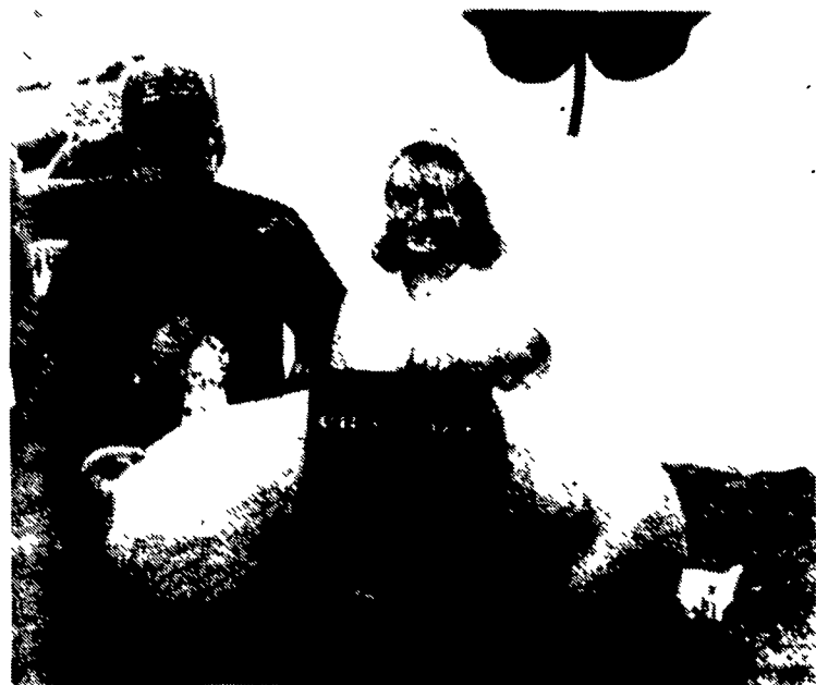
Nils Peterson of SPE Inc. purchased the 210-pound champion hog from Greta Braund for $4 per pound.