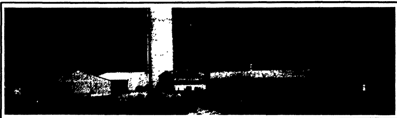
HEIFER FACILITY AND TIE-STALL BARN