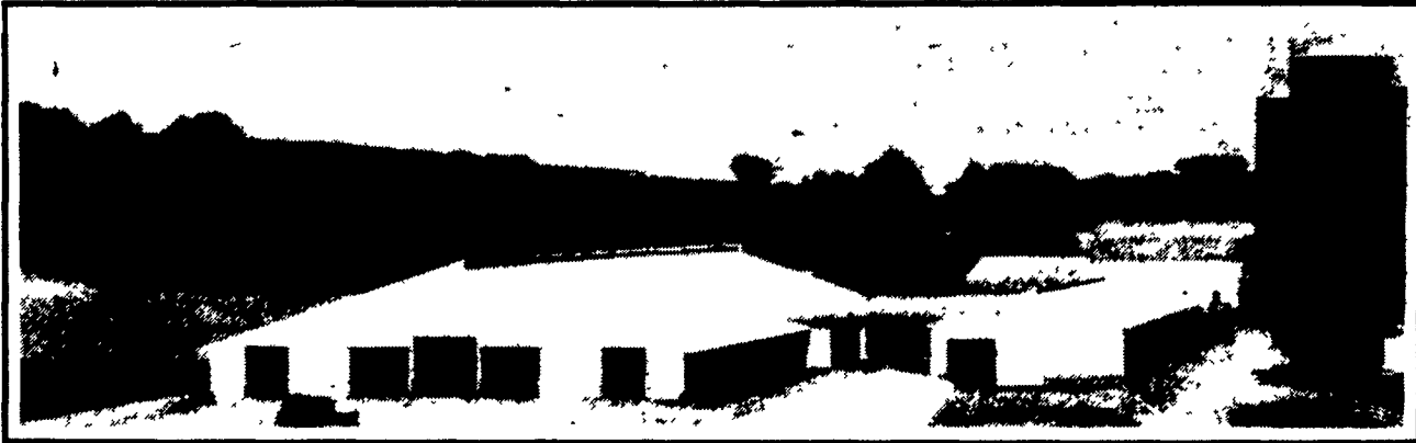
DAIRY COMPLEX (Freestall Barn and Milking Center)

Planning to expand or update? Check with Agri-Inc. where quality is our standard.