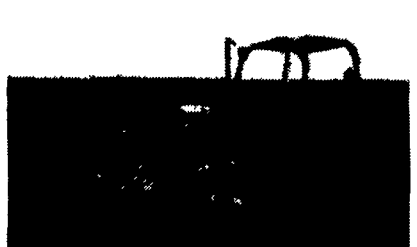
JD 555B New Pin & Bushing New Paint, Good Cond. $22,000