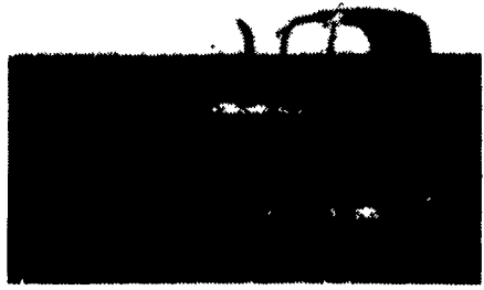
JD 450B Rebuilt Trans New Paint $13,000