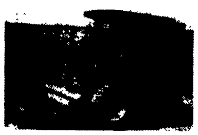
Case 1840, Choice of 2 $12,000