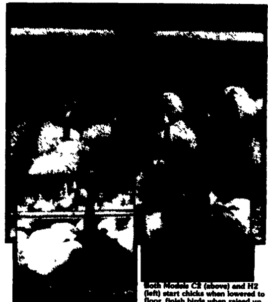
Both Models C1 (above) and H2 (left) start chicks when lowered to floor, finish birds when raised up.