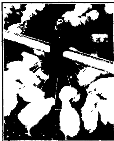
BIG DUTCHMAN BROILER SYSTEMS