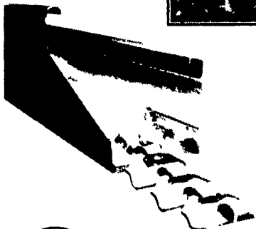
BIG DUTCHMAN FLAT CHAIN FEEDING SYSTEMS