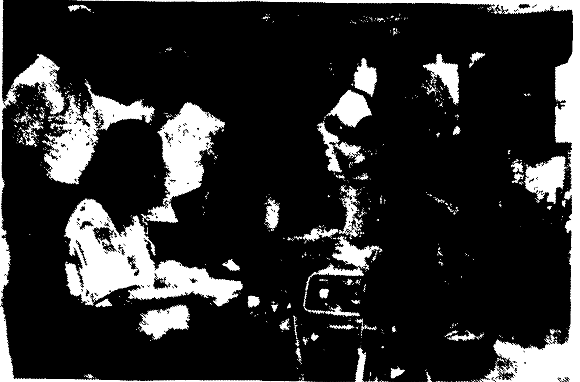
Sheep to shawl demonstrations show the complete process of making an article of clothing from raw material, an experience uncommon today.