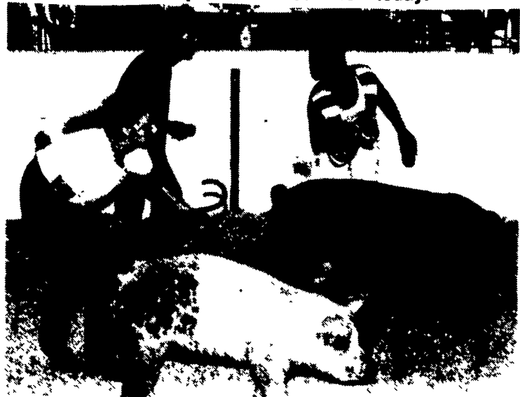
Showing swine is intense work, trying to keep the animal moving and looking good, while concentrating on the desires of the judge.