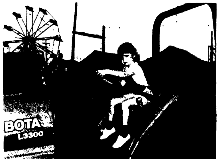
The Lebanon Area Fair has more than petting zoos, circus, rides, and agricultural commodities on display. There're tractors to try out too.