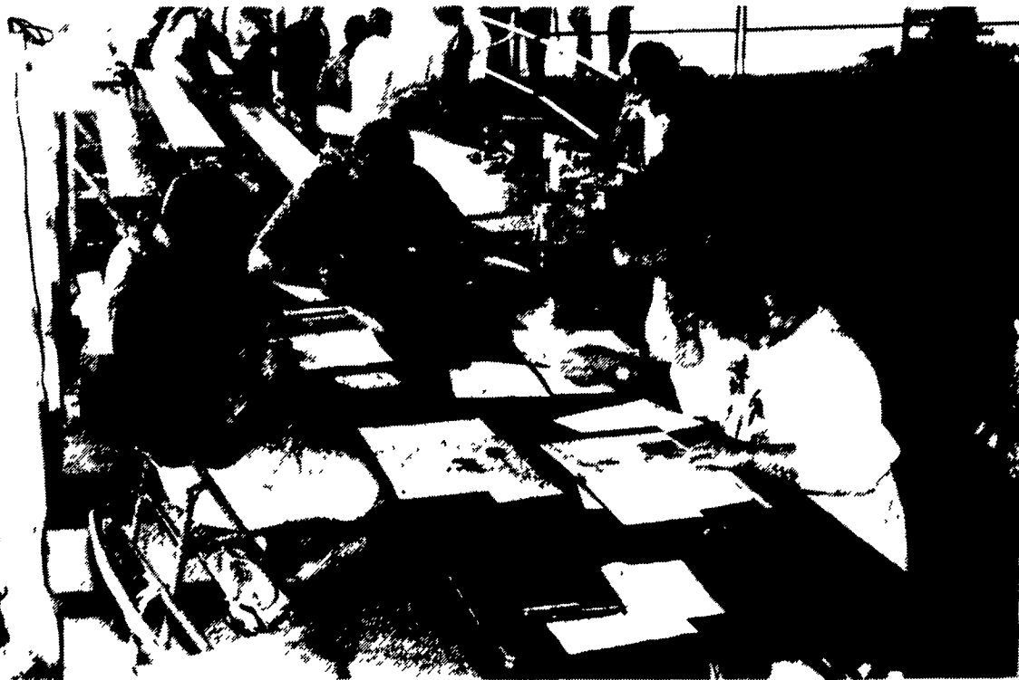
These people judge 4-H youth project books, part of a competition which rewards diligence, intelligence and accuracy.