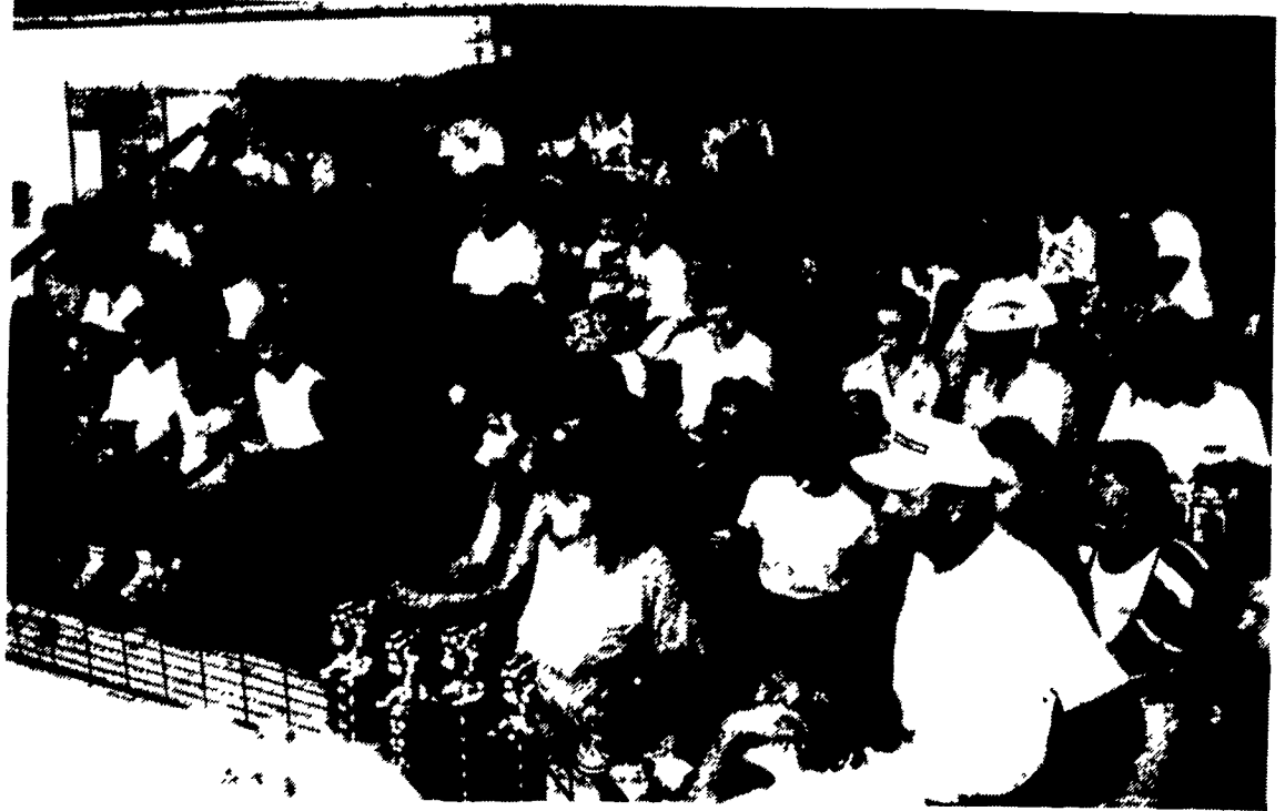
Crowds at the Lebanon Area Fair watch intently to see whose entry is judged champion and gets to take home one of the trophies.