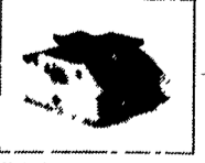
Model C74 Cattle Four-Drink Part No. 18300 42 1/2" x 35" x 19" Capacity 250 cattle