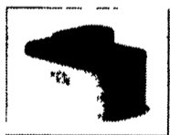
Model C72 Cattle Two-Drink Part No. 18279 42 1/2" x 24" x 19" Capacity 100 cattle