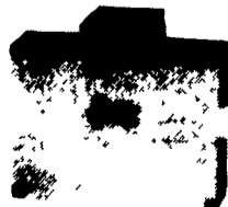
2AC Multi-Purpose Fountain Waters calves, sheep and goats. Perfect for box stalls, small lots or fence-lines. Waters up to 40 cattle/100 calves. Part No. 12295 10" x 24" x 18" high Electric (280W CSA approved)