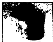
Model C71 Cattle One-Drink Part No. 18271 28" x 20 1/2" x 19" Capacity 50 cattle

The Oldest Company With Electric & Energy-Free Fountains... The Winter of '94 Was Problem Free!