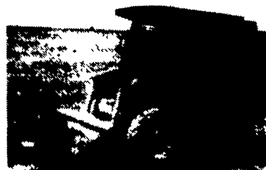
Case 1840, Choice of 2 $12,000