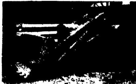
JD 450 crawler loader, like new U/C, cleaned & painted $10,000

No Reasonable Offer Refused Custom Repairs On All Makes Industrial & Farm Equipment