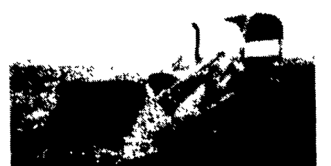
JD 450C crawler loader, new U/C, cleaned & painted $16,000