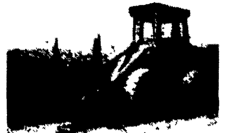
JD 544B with logging forks or bucket $22,000