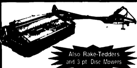
Also Rake-Tedders and 3 pt. Disc Mowers

Come and Take Your Pick from our Selection of Used Haybine and Mower Conditioners