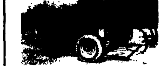
With Hyd. Lift Coulters $6,500

Excellent Condition Case IH 6500 9 Shank Consertil