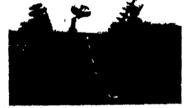
UM2726 Good Condition, New Disks Only $6,800

Krause 18 Foot Center Fold Rock Flex Disk Harrow