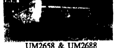
UM2658 & UM2688

Tow Away At Reduced Price Today Take Your Pick From (2) New Holland 489 Haybines