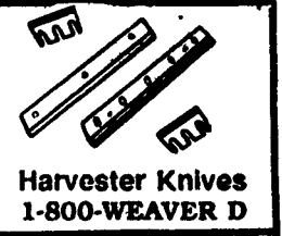
Harvester Knives 1-800-WEAVER D

LIGHTNING Material Installation Free Estimates Information mailed Call toll free: 1 800 532-0990