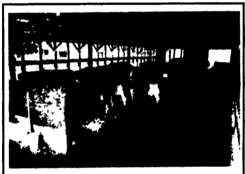
8 Ft. Deep Pit With Waffle Slats And Rubber Dust Mattresses.