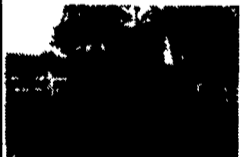
1990 Case 580K (Phase III), 4WD, Cab, Extendahoe, 2260 Hours $33,500