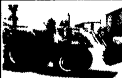
Fiat Hesston 780, 4WD, 70 HP Diesel, w/Loader $11,900 Waiver to 1-1-96