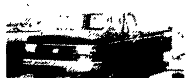
'89 Ford F-150 6 Cyl., Stick, PS, Heck Of A Work Truck $5,995