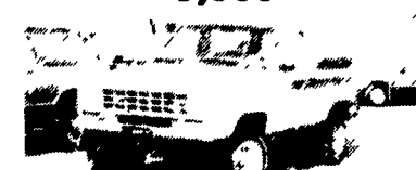
'88 Bronco II Red/Silver, V6, Stick, Power Equipment, Lots of Extras $7,995