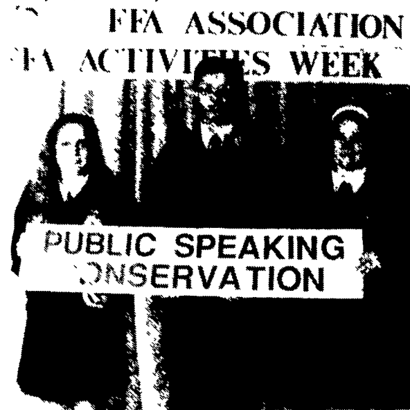
Conservation public speaking: 2nd Place Coudersport, 1st Shippensburg, 3rd Upper Dauphin.