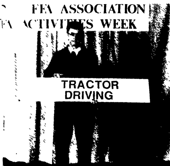
First place tractor driving-Knoch High School.