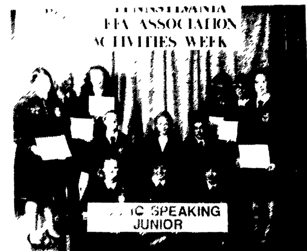
Junior public speaking-Gold Medal winners.