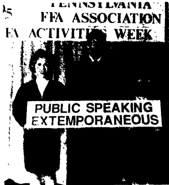
Extemp. public speaking winners-2nd place Bellefonte, 1st-Warwick, 3rd Conrad Weiser.