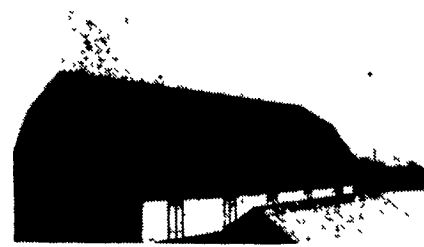
Use on Barns Or Garages