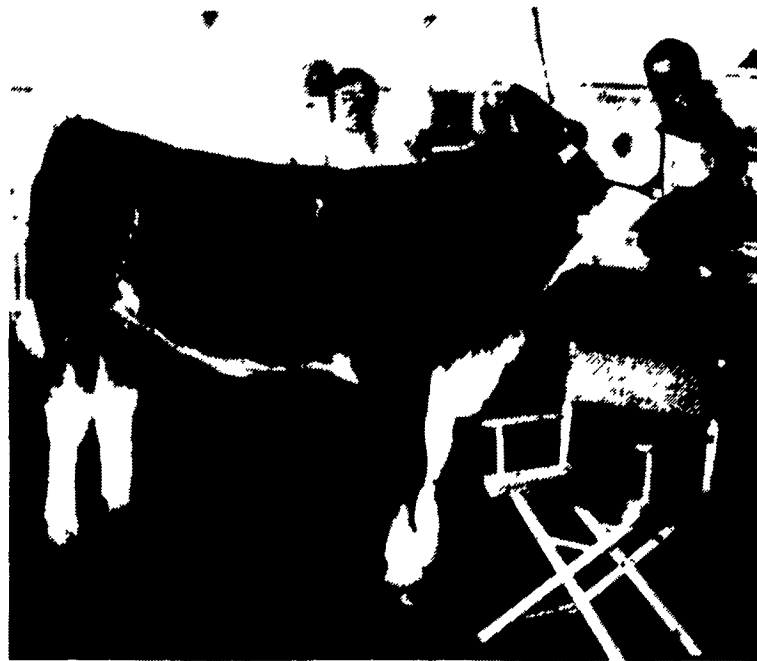
Supreme champion beef animal was shown by Troy Gelsinger of Wernersville.