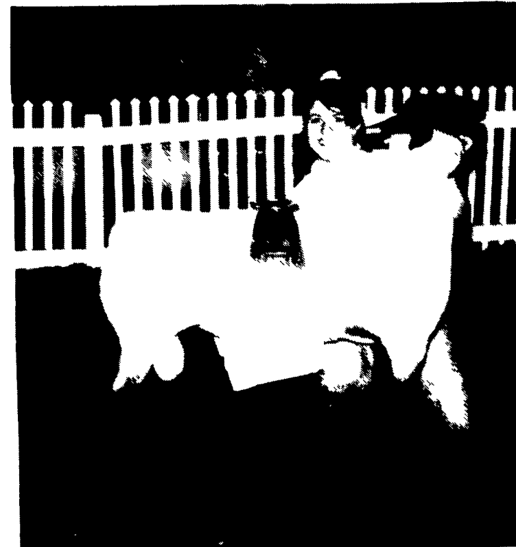
Melanie Snyder of Parker showed the supreme 4-H champion ram.