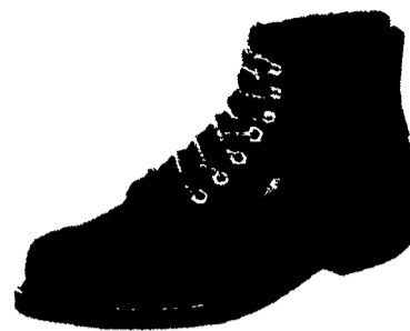
6 inch style 344

Made of rugged American horsehide leather. Horsehide is more resistant to barnyard acids, silage acids, milk, fertilizer, concrete, oil and grease.