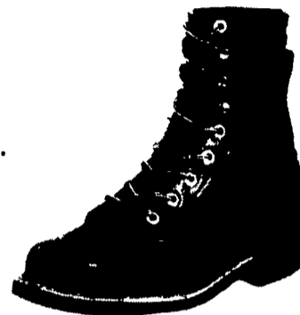
8 inch style 844

These shoes are generously sized and come with small can of mink oil.