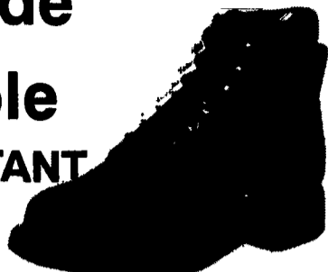
6 inch style 346

NEW HEAVY DUTY SHOE This deluxe shoe features tough long lasting HORSEHIDE LEATHER and features a rugged Marathon sole. Horsehide is the most durable, acid resistant, leather we know of. Excellent for farm use, construction use or any purpose where rugged and long wear is desired. This shoe features a one piece sole and heel construction, Genuine Goodyear welt and storm welt. Extra stitching at stress points, thick, soft padded collars made of leather, Permafresh cushion insoles and arch supports. Hooks and eyes. Steel shank. Oil resistant soles. Shoes are generously sized. Top Quality American Construction.