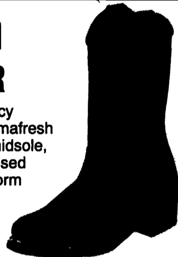
12" Western Engineer

12 inch Western Engineer boot in fancy brown full grain cowhide leather. Permafresh cushion insole, steel shank, leather midsole, long wearing oil-resistant sole with raised heel. Genuine Goodyear welt, and storm welt. Popular truck drivers boot. American Made Sizes 7-13 including 1/2 sizes.