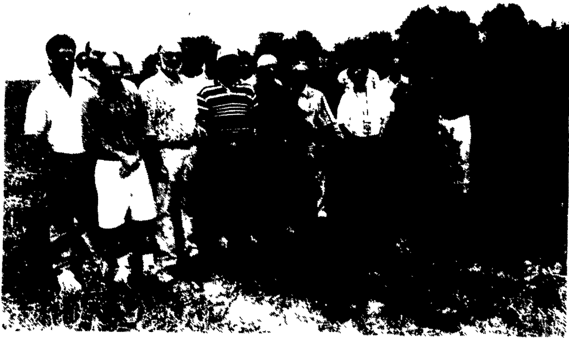
Thirty-nine Landis Bros. Inc. employees gather around the plow for ground breaking ceremonies. Each employee was interviewed by the builder to determine the needs and insight each have in order to make the new facility a more efficient, pleasant, and safe worksite.

The dealership has consistently received Super Service Dealer awards, which is given to only 20 dealerships out of approximately