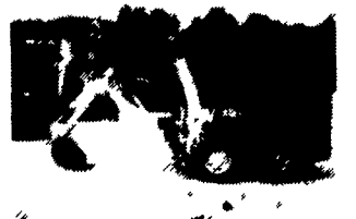
'85 John Deere 125 w/Bradco Backhoe ATT.....$12,000