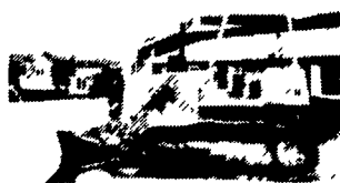
'85 John Deere 750B Crawler Dozer 4-Way Angle Blade OROPS Canopy.....$40,000