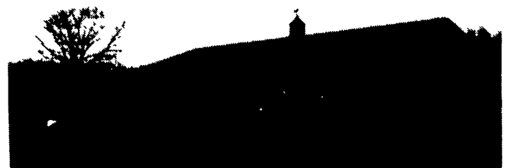
60x104 w/30' Stable Area

Construction and Custom Design of: • Arenas • Dairy Barns • Horse Barns • Storage Buildings