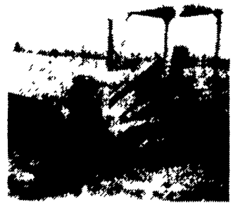
1987 Cat 935B, One Owner, 2100 Original Hours, New Sprockets, Bushings Turned, Original Paint. $27,000

JLG 60F Manlift 8' Basket w/Rotator, Good Condition $19,500 Best offer Financing & Lease Purchase Available