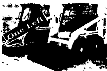
Bobcat 743 skid loader 1988 w/cab enclosure aux. hyd. $8,500