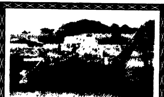
Case 530CK Gas Wheel Loader Backhoe. Very Good Condition. $6,000

Heavy Equipment Loader Parts, Inc. RD 2, Box 2230, Route 22, Grantville, PA 17028 (717) 469-0039 (800) 446-0505 FAX (717) 469-7679