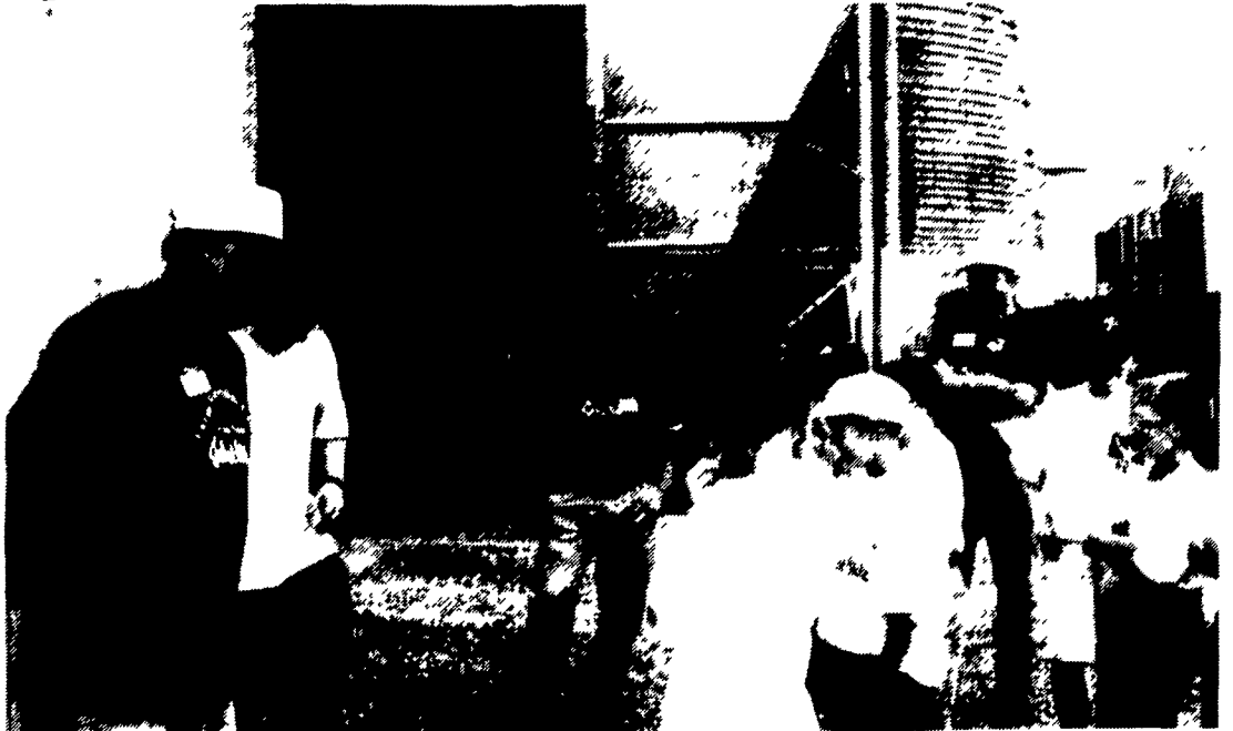
More than 50 volunteers helped to conduct the Farm Safety Day Camp. These included volunteers from Cargill Inc., PP&L, area doctors, nurses, firemen, and police, New Holland, Case Unloader, and FFA Chapters.

Lunch was provided by Oregon Dairy Restaurant. Snack and distribution of farm safety books and participation certificates were given to conclude the camp. Each participant received a t-shirt and a door prize.