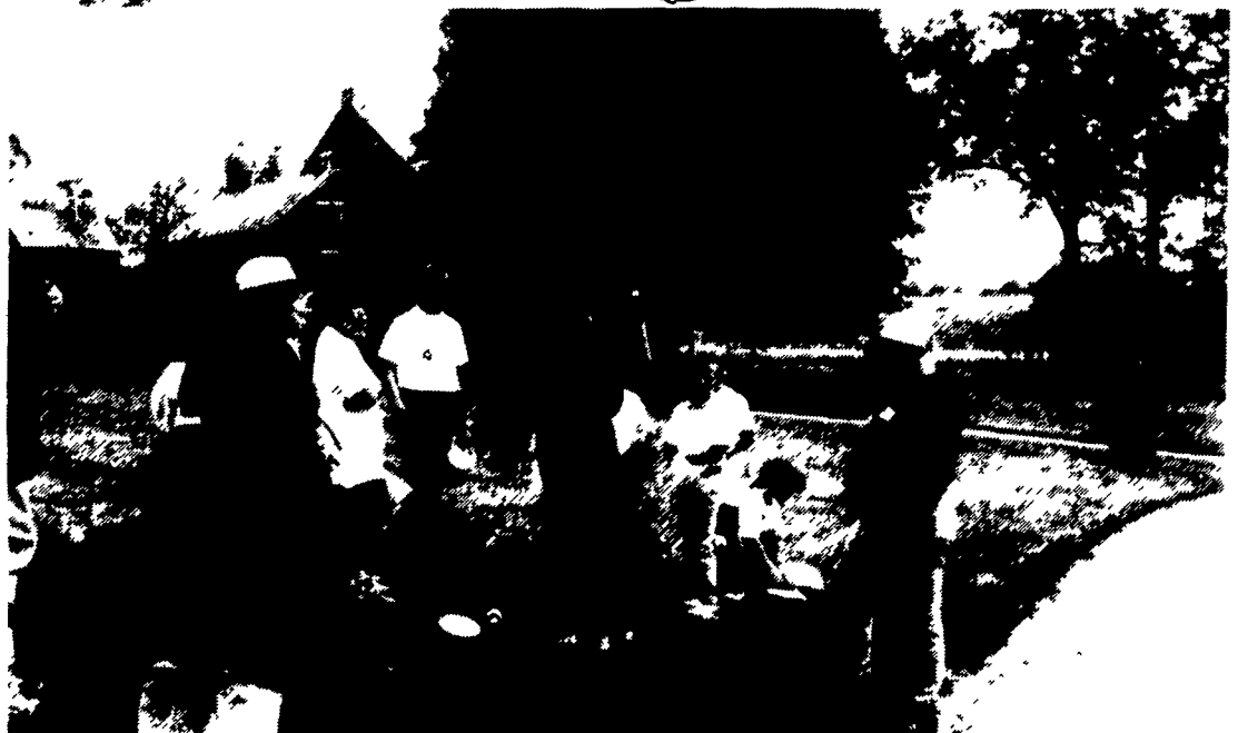
Lancaster County has the highest farm accident rate in the state. The Farm Safety Day Camp was held to teach children safety precautions when working and playing on the farm.