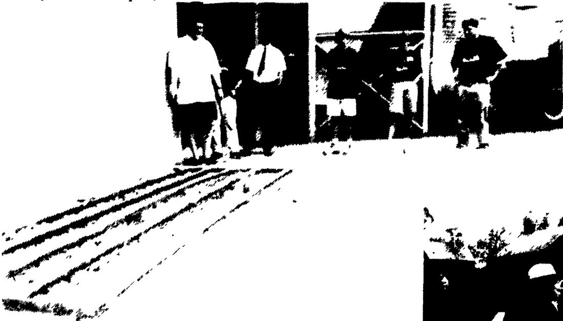
This demonstration shows what would happen if a toddler attempts to climb an unused cattle gate propped against the barn. Notice the busted cantaloupe.