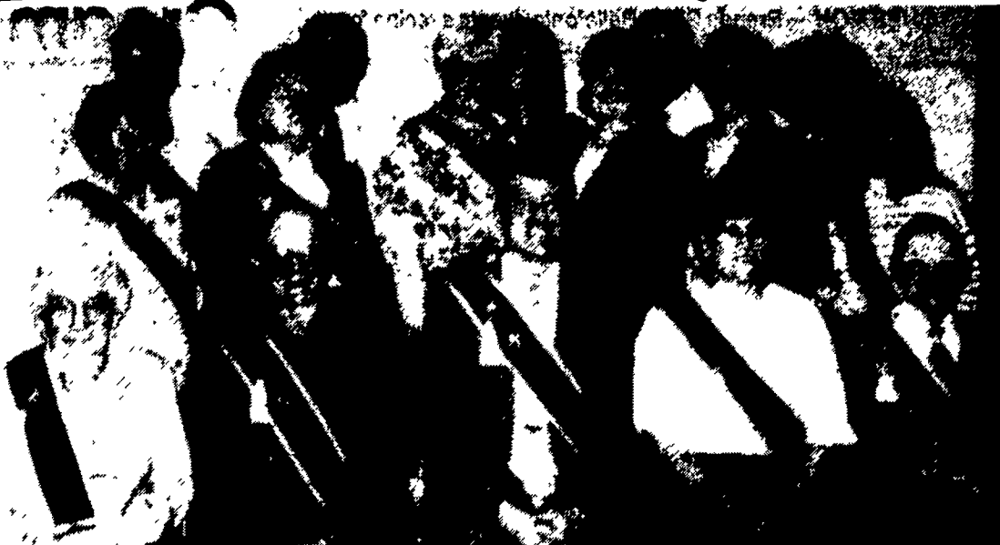
Officers of Marion Grange #1853 are celebrating the grange's 75th year of service to the community.