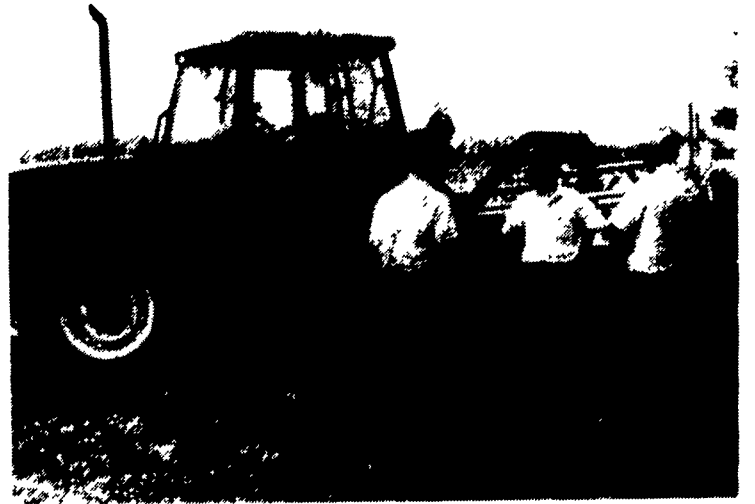
Those who attended the BACS Field Day had a chance to look at the New Holland 499 haybine.

In one trial, timely application of insecticide worked to control cutworm damage. In another, Roundup Ready soybeans were planted early in the month in a field