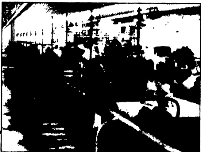
Coated With Baked On Top Grade TGIC Polyester Urethane Powder After Fabrication